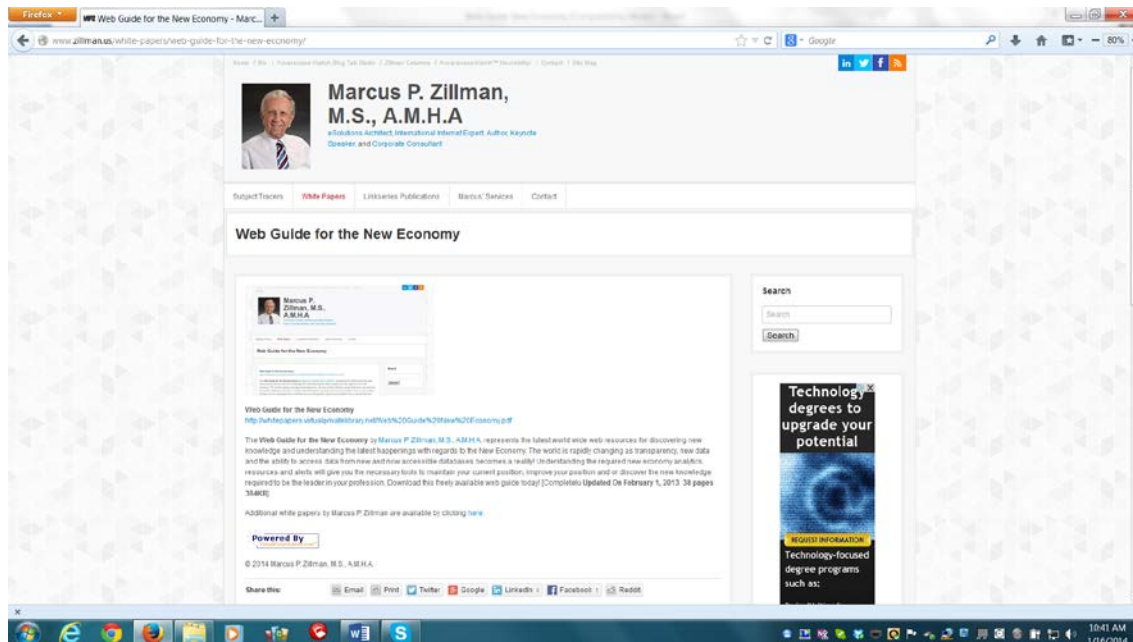
Figure 1: Web Guide for the New Economy Subject Tracer™ Information Blog

Understanding the required new economy analytics, resources and alerts will give you the necessary tools to maintain your current position, improve your position and or discover the new knowledge required to be the leader in your profession.