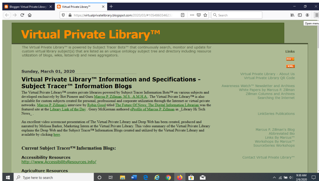
Figure 1: Virtual Private Library™